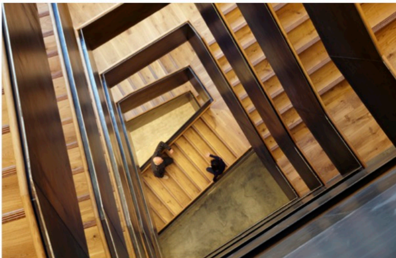
Above - Staircase birds-eye view, 6th floor © Jack Hobhouse